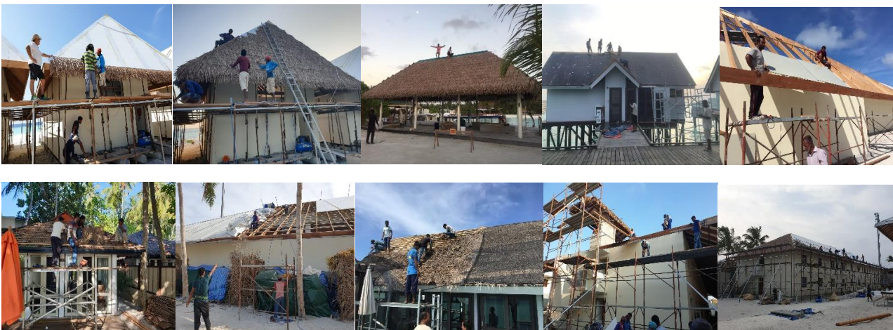
Maldivian tradesmen on resort roofs at it.....